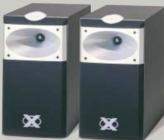
X 510 ( SUR )