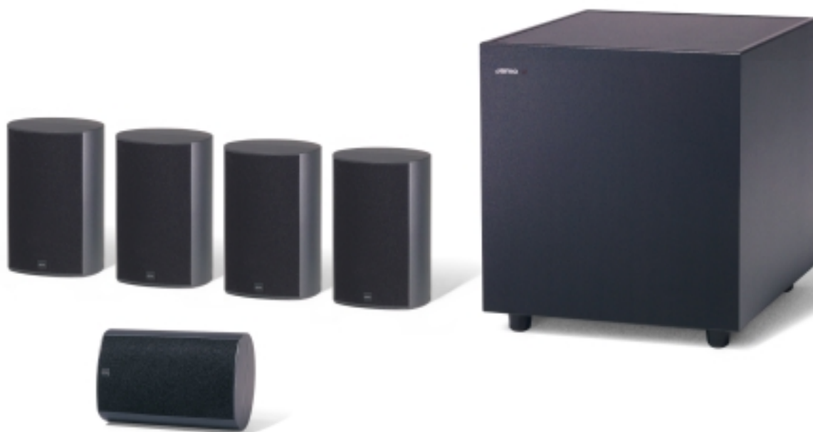
A 310 (Front,CEN,SUR)